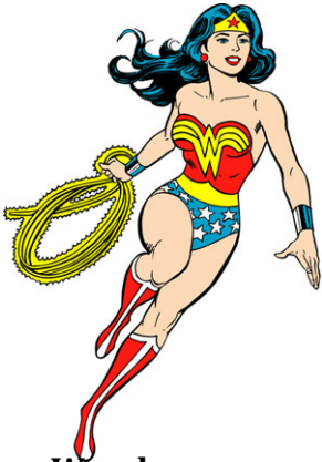
Wonder woman gg, ff, SS, Bb